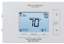
Copeland 80 Series