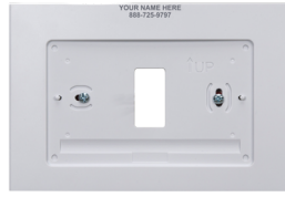
Sensi/80 Series Wallplate