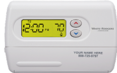
Classic 80 Series